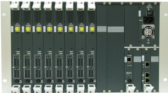
HG-3000/6U VoIP-GSM Gateway