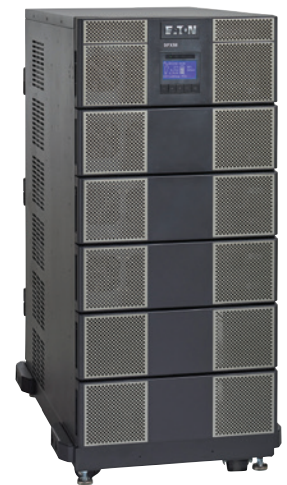
12-slot cabinet is scalable to 20 kVA (N + 1) in a 21U cabinet