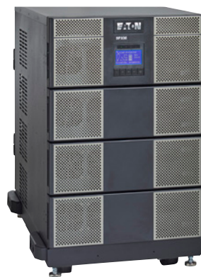
8-slot cabinet is scalable to 16 kVA in a 14U cabinet