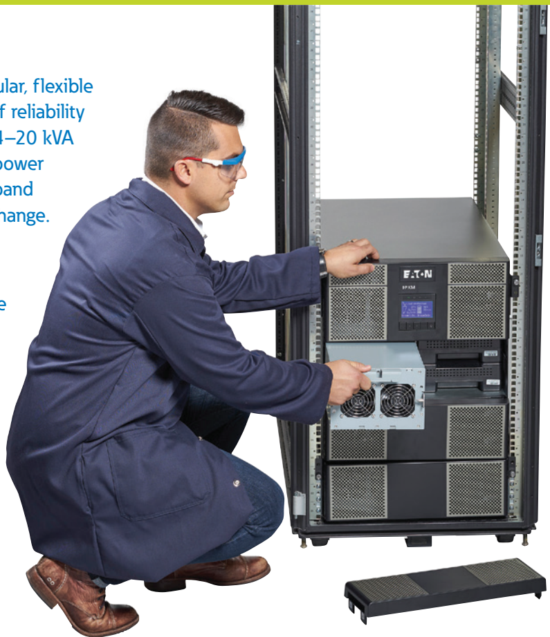
Easy hot-swappable power and battery modules

The plug-and-play power and battery modules are user replaceable so you can add them as needed without a service call or having to put a redundant system in bypass. With its low initial investment, online double-conversion technology, Eaton ABM® technology and high efficiency mode, you never have to compromise reliability for efficiency.