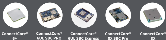
ConnectCore® 6+ ConnectCore® 6UL SBC PRO ConnectCore® 6UL SBC Express ConnectCore® 8X SBC Pro ConnectCore® 8X