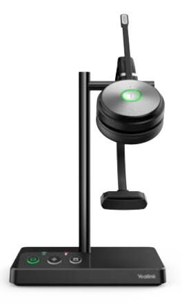
WH62 Mono Teams WH62 Mono UC