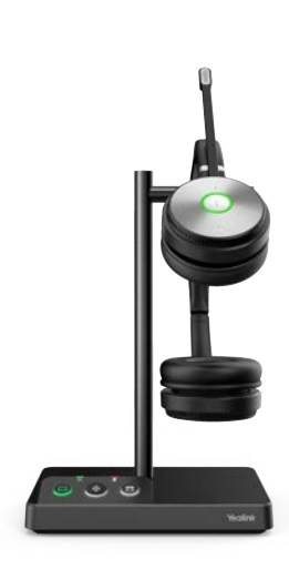
WH62 Dual Teams WH62 Dual UC

Based on hundreds of headform evaluations and thousands of wearing comfort tests, WH62 well meets the ergonomic requirements. Besides, with premier soft leather cushions and lightweight design, you can wear it all day comfortably. For more workspace freedom, WH62 can also free you up to 160m away from the desk.