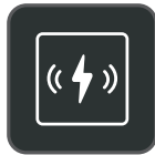
Qi Wireless Charger