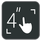
Touch Screen LCD