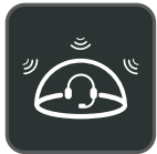
Acoustic Shield Technology

The Yealink WH66 is the Industry-leading DECT wireless headset, with WH66 Dual and WH66 Mono two models, opening an entirely new form of desktop collaboration. Work seamlessly with major UC platforms and integrate natively with Yealink IP Phones. 4.0 inch (480 x 800) capacitive touch screen of base offers newly work experience, just one touch, all control. Act as a workstation, managing phone calls, connecting with multiple devices (desk phone/mobile phone/computer), charging mobile phone wirelessly, and even playing a speakerphone's role. Best of all, deploying such a multifunctional workstation only needs to plug directly. Easiest things to do, greatest convenience to enjoy.