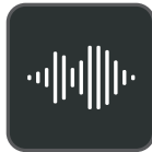
Optima Audio Experience