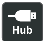
Built-in USB Hub