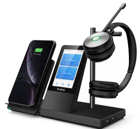
WH66 with charger * Wireless charger is optional

Busylight is enabled in WH66. With the light on the headset or BLT60 on the desk turning red, people around you would know that you are on the phone, instead of interrupting you unknowingly. Just stay focused on conversation, for higher efficiency, for better collaboration.