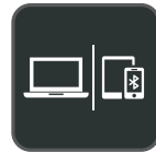
Multiple Devices Connection