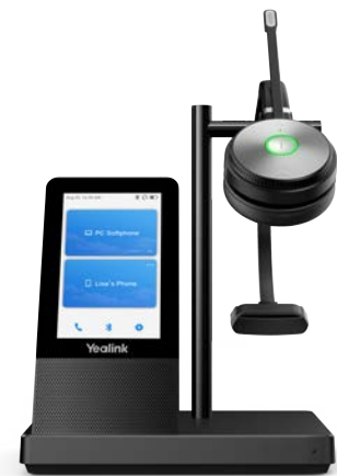
WH66 Mono/Dual: Teams WH66 Mono/Dual: UC