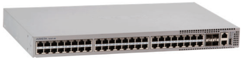
Arista 7010T-48: 48 port 10/100/1000 and 4 port 10GbE Switch

Consuming under 52W the 7010T are extremely power efficient at less than 1W per port. Built in power redundancy and customer reversible redundant fans allows cooling airflow in either forward or reverse direction in a single system.