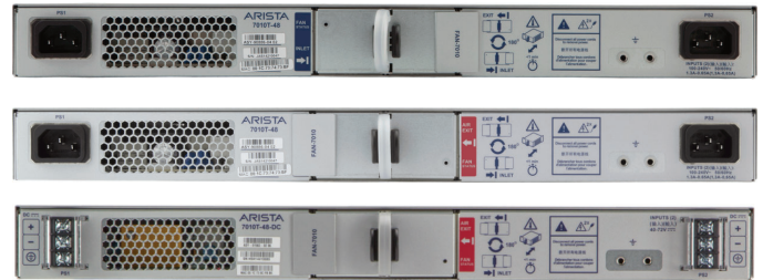
Arista 7010T Rear View - reversible airflow, AC & DC