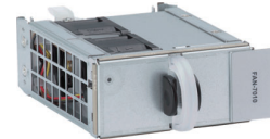
Arista 7010T hot swap and reversible fan module