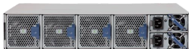
Arista 7050X 2RU Rear View: Rear-to-front airflow model (blue)