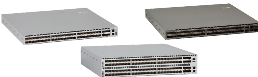
Arista 7050SX Series of 1/10GbE and 10/40GbE Switches Top left: 7050SX-64, right: 7050SX-72, bottom: 7050SX-128

Combined with Arista EOS the 7050X Series delivers advanced features for big data, cloud, virtualized and traditional designs.