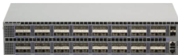
Figure 6: Arista 7260CX-64 series

The 7260CX-64 is a 2 RU system that provides 64 QSFP100 ports and 2 SFP+ ports. Each QSFP100 port can be individually broken out into 4 ports of 10GbE or 25GbE; 2 ports of 50GbE or used as a single port of 40GbE or 100GbE.