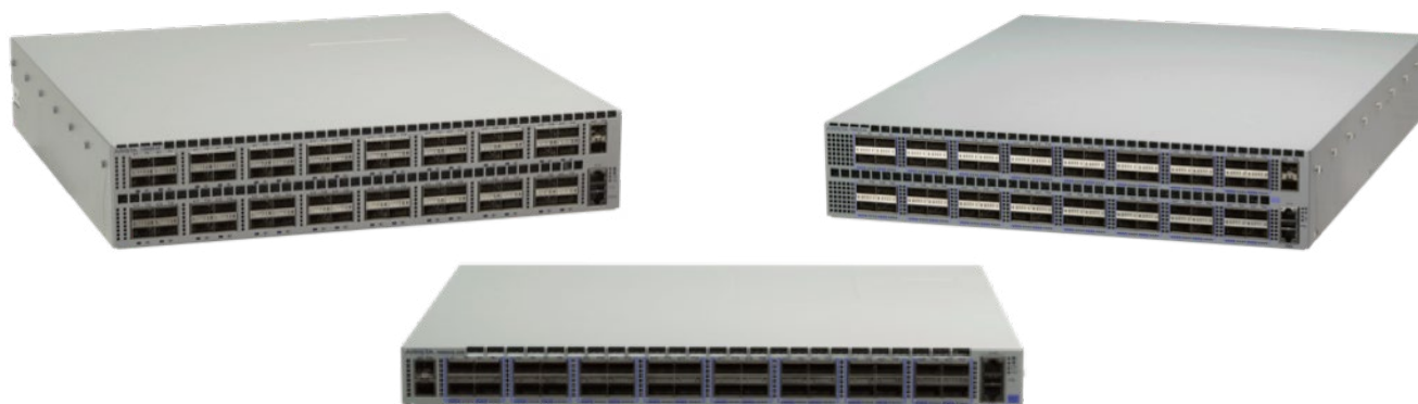
Figure 1: Arista 7060X &amp; 7260X series overview

At their core the 7060X, 7060X2 and 7260X series are specifically developed to address the requirements for increasing server and storage interface speeds. Faster host connectivity gives rise to a network requirement for the forwarding of a significantly greater number of packets per second. In order to meet this requirement the 7060X, 7060X2 and 7260X feature an optimized forwarding pipeline supporting wire-rate forwarding even under extreme loads.