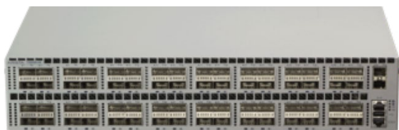
Figure 5: Arista 7260QX-64 series

The 7260QX-64 is a 2 RU system that offers 64 QSFP+ ports and 2 SFP+ ports. The QSFP+ interfaces each support wirespeed 40GbE, enabling high density with a single chip design that ensures latency remains below 550ns regardless of ingress and egress port mappings, while maintaining consistently low jitter.