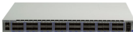
Figure 4: Arista 7060CX-32S series

The 7060CX-32S is a 1 RU system with 32 QSFP100 ports and 2 SFP+ ports. Each QSFP100 port can be individually broken out into 4 ports of 10GbE or 25GbE; 2 ports of 50GbE or used as a single port of 40GbE or 100GbE.