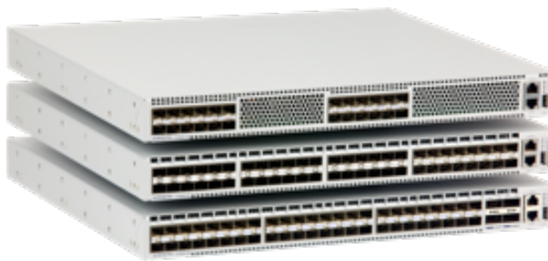
Arista 7150 Series

Designed to suit the requirements of demanding environments such as ultra low latency financial ECNs, HPC clusters and cloud data centers, the class-leading deterministic latency from 350ns is coupled with a set of advanced tools for monitoring and controlling mission critical environments.