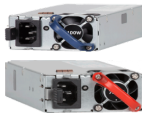
Hot swap power supplies