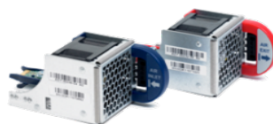
Hot swap fan modules