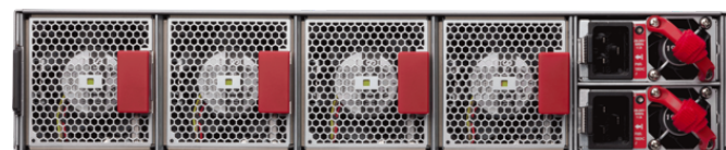
Arista 7280R 2RU Rear View: Front to Rear airflow (red)