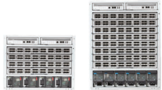
Arista 7300X Series Chassis

The midplane is completely passive and provides control plane connectivity to each of the fabric and line card modules. The system is optimized for data center deployments with front-to-rear and rear to front airflow options.