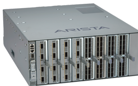
Arista 7368X4: 128 ports of 100G or 32 ports of 400G

Combined with Arista EOS the 7368X4 series deliver advanced features for hyperscale networks, server-less compute, big data farms and machine learning clusters.