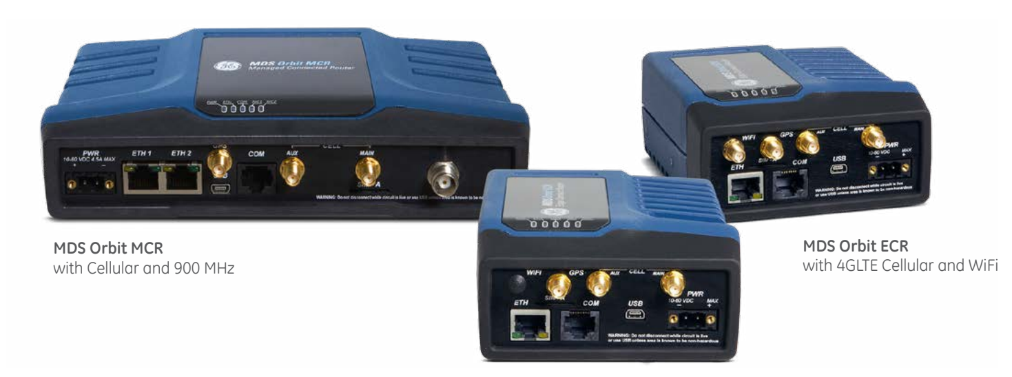
MDS Orbit ECR with 4G LTE Cellular

An easy-to-use Graphical User Interface (GUI) allows for the quick provisioning and maintenance from a web browser. MDS Orbit's wizards accelerate the configuration of complex network functionality by breaking down processes into simple, concise and automated steps.