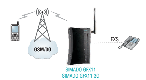
SIMADO GFX11 in Stand-alone Mode

SIMADO GFX11 supports programming of a help-line or emergency number as a Hotline number. Hence, during any emergency situation the caller can dial the emergency number just by lifting the handset. SIMADO has important usage at places like National Highways, Hospitals, Railways, Airports, etc., which are prone to high-emergency occurrence.