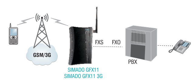
SIMADO GFX11 With PBX