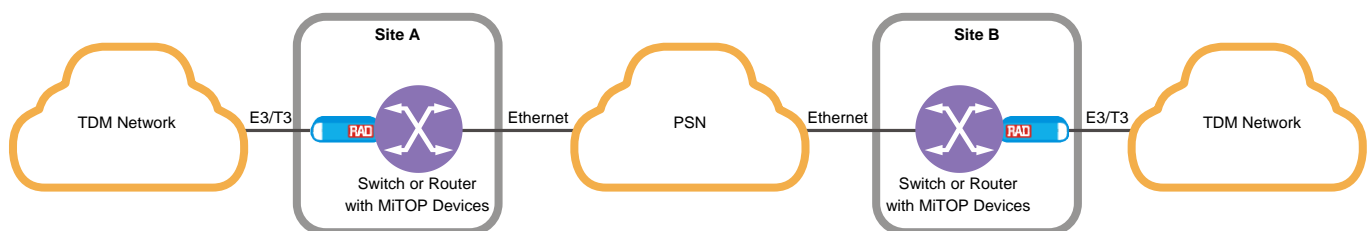
Figure 1. Delivering E3/T3 Services over PSN

The configuration adapter is used for preliminary configuration or software download.