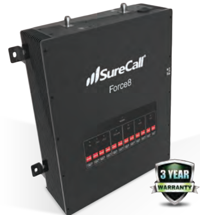
The SureCall Force8 Industrial Amplifier

* Performance and coverage area are dependent upon the strength of cell signal outside of the building and density of structure and materials inside of the building.