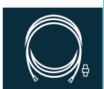
RG-11, 50 ft, optional adaptor