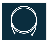
SC-240, 20 ft