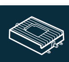
Booster and Power Supply