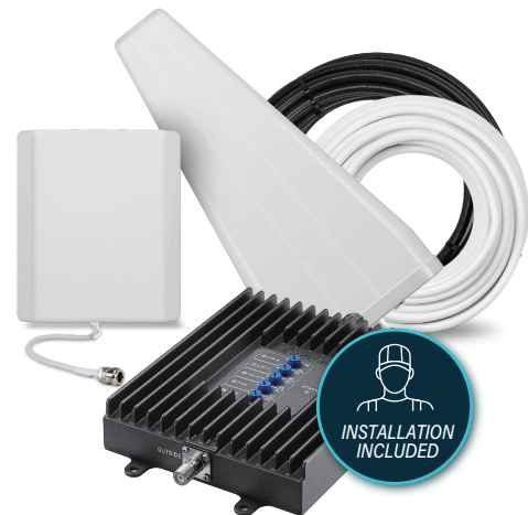
Shown: Fusion Install signal booster kit