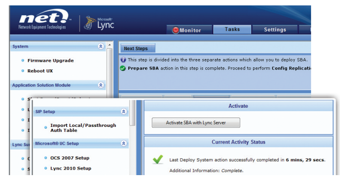
Figure 2: UX1000 secure, integrated web GUI for gateway and SBA management

WEBSITE: Please visit our website at www.net.com for information on how to contact us, place an order or get more information on NET solutions.